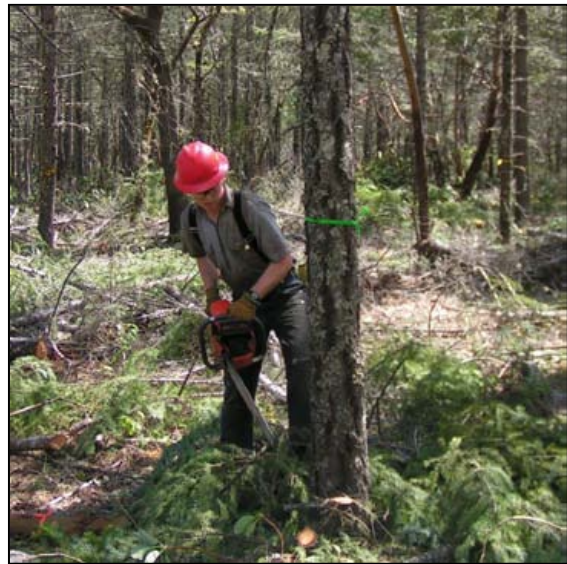
Hand thinning on a stewardship contract. Photo from the Lomakatsi Restoration Project ( 1014 ).