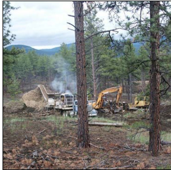
Biomass removal in ponderosa pine.