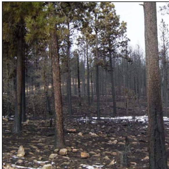
Aftermath of the Ojo Peak Fire in New Mexico. Photo from Kent Reid ( 1026 ).

As concern over greenhouse gases increases and carbon markets become a reality, the carbon emissions from burning biomass will become a greater concern. Utilization of biomass temporarily stores the carbon from woody biomass in products or allows it to be used in place of fossil fuels to generate heat or power. Where biomass replaces fossil fuels in heat or power generation, its carbon is still released but less total carbon is released than if the biomass was burned in the forest and fossil fuels were used to generate the heat or power (Finkral and Evans 2008).