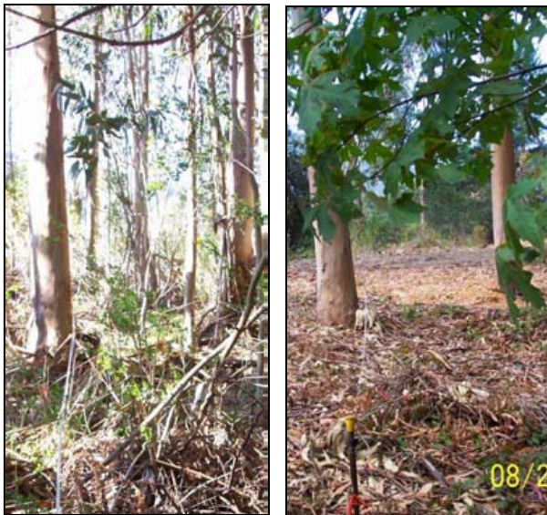
Before and after treatment in eucalyptus.

Although much attention has been focused on biomass removals where the main purpose is fuel reduction, it is important to recognize that many projects are driven by silvicultural or restoration aims. Forest managers often want to remove small-diameter or otherwise low-value trees to increase the growth of the remaining trees or to permit new seedlings to grow. These silvicultural objectives are easier to achieve when markets and infrastructure reduce the cost of biomass removals. Restoration objectives are often required with biomass removal where fire is the dominant disturbance regime (see Section 8 Fire), but in some cases the objective may be to grow bigger trees faster to replicate late successional forest conditions as soon as possible (e.g., 1015 ).