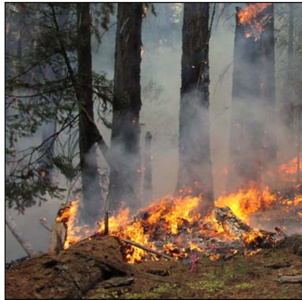
Prescribed fire in Sequoia National Park.

Fire hazard reduction drives biomass removal projects in most fire-adapted forests. The unprecedented scale and cost of recent wildfires across the Western U.S. have drawn public attention to the problem of unnaturally dense forests that may soon ignite. There is a widespread push to reduce fuels—live and dead biomass—that have accumulated during many years of fire suppression policies. In addition to the basic desire to reduce fire hazard, the case studies demonstrate the impact of fuels treatments on fire behavior, the importance of prescribed fire in maintaining fuel reduction benefits, and potential fire related co-benefits of biomass utilization.