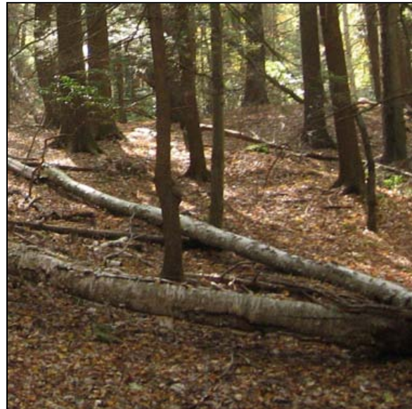
Coarse woody material in a hemlock/hardwood forest in Connecticut.

Minnesota's biomass guidelines present data that show soil nutrient capital is replenished in less than 50 years even under a whole-tree harvesting scenario (Grigal 2004, MFRC 2007). A study from Denmark indicates that harvesting of whole green trees can have a short term (four year)