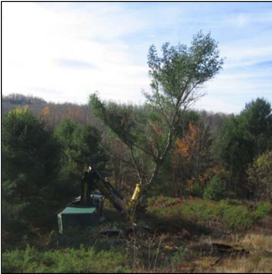
Feller-buncher harvesting low-grade white pine.

New technologies that are designed specifically for biomass removal may reduce the costs of cutting and processing small-diameter material. One case study highlights a brush mulcher specially designed to shred all the smaller underbrush, tops, and slash ( 1006 ). Another describes the testing of a mulching system (Fecon FTX 440) combined with a modified corn hopper to collect the chips ( 1024 , see also Small Diameter Success Stories III p. 16). In the Western U.S., mastication is most efficient at fuel loadings of less than 25 tons per acre and where the residual stand has fewer than 100 trees per acre (USFS 2004b). An alternative to chipping or mulching systems is densification of biomass from forests through bundling systems (Arnosti et al. 2008). Other publications have focused entirely on harvesting technologies (Windell and Bradshaw 2000, RE Consulting and Innovative Natural Resource Solutions LLC 2007).