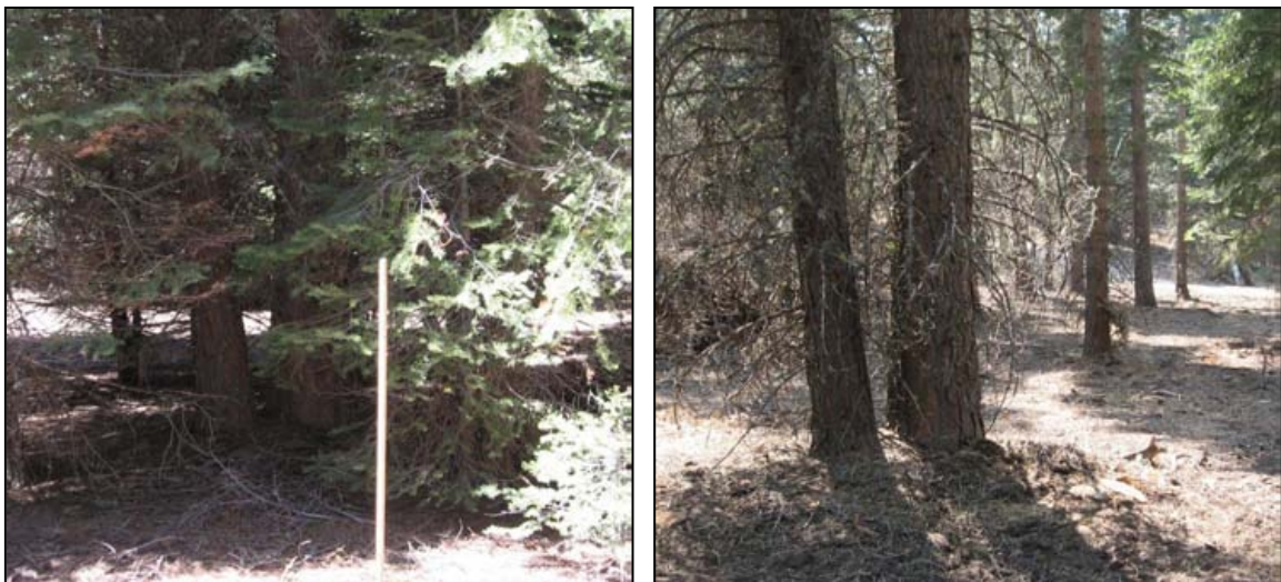
Before and after treatment at Lassen Volcanic National Park. ( 1002 ).