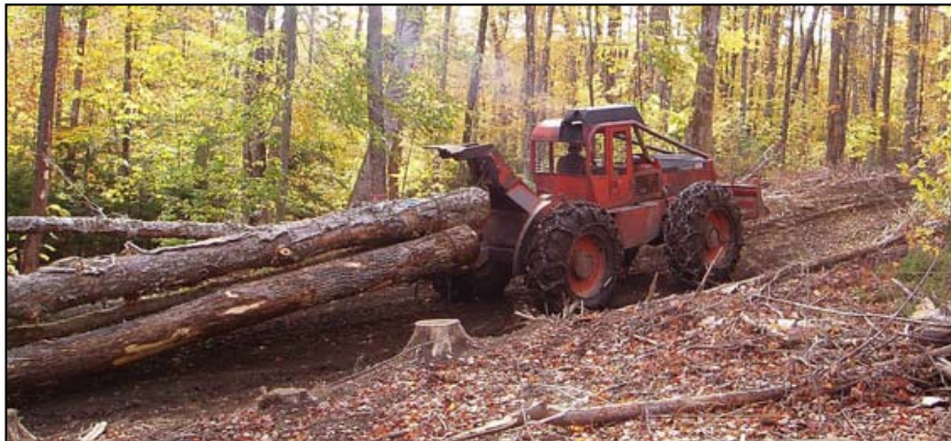
Low-quality logs removed with a cable skidder.

The case studies come from parks, conservation lands, private forests, state lands, and federal ownerships. Each case study focuses on the project level and details silvicultural prescriptions, harvesting techniques, products, markets, and prices. The synthesis of these case studies provides insight into successful strategies as well as potential pitfalls. The results paint a picture of the state of biomass removals in the U.S. and provide land managers with examples of how to implement wildfire hazard reduction and stand improvement strategies using biomass removal and utilization.