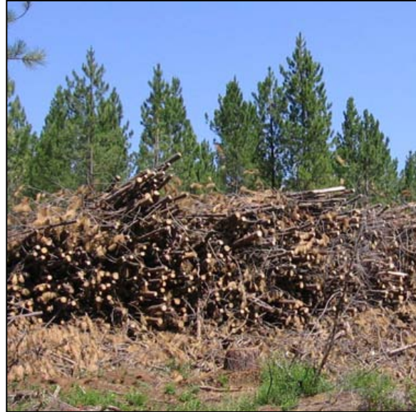
Landing piles utilized for biomass chips. Photo from Mike Bechdolt ( 1010 ).