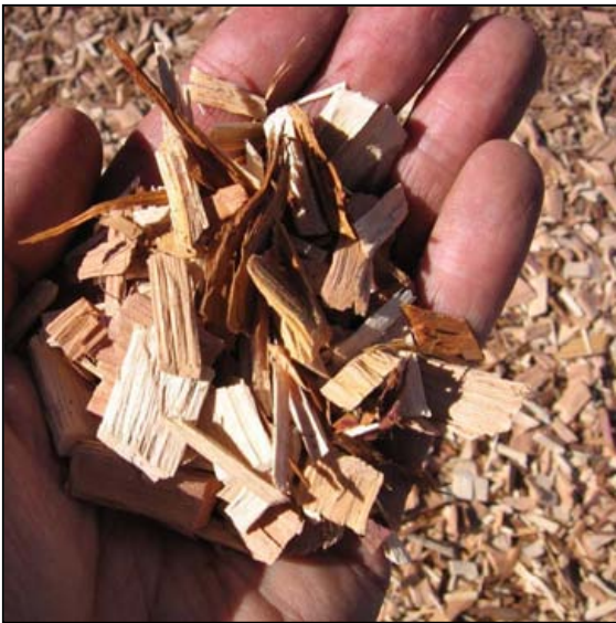
Chips from a BLM removal of western juniper.

While increased mechanization is not a guarantee of success, equipment such as feller-bunchers and masticators can help efficiently remove woody biomass or reduce it to chips. In North Carolina, for example, the contractor in one case study received a lower price for woody biomass because his operation did not have the capacity to produce a large enough volume of chips, while in a different case study the contractor was able to generate income even with a 100-mile haul distance by using an array of harvesting machines.