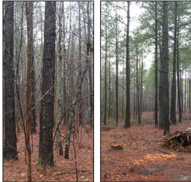
Before and after biomass removal in North Carolina.