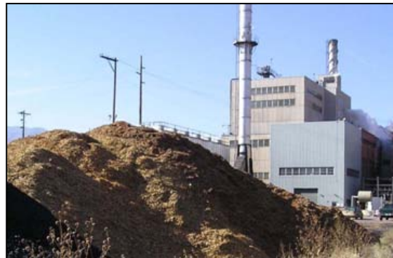
The Aquila Power Plant and biomass from BLM project.