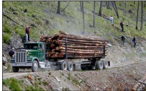
Log truck on private land in Montana.

While a short-haul distance from forest to utilization lowers project costs, based on our case studies long-haul distances do not necessarily doom a project to failure. For example, projects such as Delectable Mountain, Vermont, sent chips 70 miles and pulp wood 100 miles and was still able to generate a profit ( 1032 ). In the West, successful projects such as the Weaverville Community Forest, California, had chips trucked 65 miles ( 1027 ), and the Elk City, Oregon, project sent pulpwood 125 miles ( 1029 ). Of