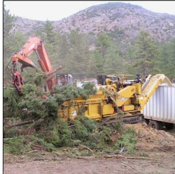
Biomass being chipped after a fuel reduction project.

Removal of biomass material for hazardous fuel reduction or stand improvement is both a key forest management challenge and a significant opportunity for achieving management objectives. Woody biomass has long been a useful but underutilized byproduct of forest management activities. Now rising energy costs, concerns about carbon emissions from fossil fuels, and the threat of catastrophic wildfires have greatly increased interest in using woody biomass from forests. For example, the U.S. Department of Energy (DOE) has set a goal to increase domestic biofuels use