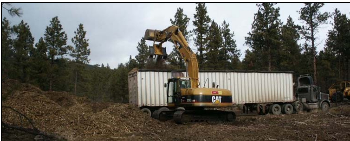
Loading a chip van on a BLM pile removal project in Montana. Photo from Mike Small ( 1018 ).