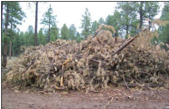
Slash pile after a thinning in ponderosa pine.

Perhaps the most important lesson to draw from regional differences in biomass removal is that project specifics should be driven by the biophysical conditions and social context of each site. Strategies that fit fuel reduction projects in ponderosa pine may be inappropriate for the northern hardwood forests of Vermont.