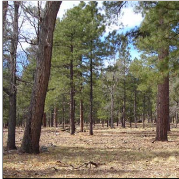
A ponderosa pine stand after a restoration treatment. Photo from Alex Finkral ( 1030 ).